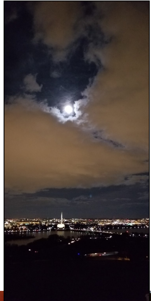
Monday night's view from Top of the Town was quite impressive. The moon managed to show itself a few times during the evening. PBS broadcasts the July 4th fireworks each year from this very same spot!